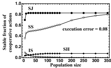
Figure 1: Stern-judging (SJ) is able to foster the highest rates of cooperation, independently of the population size; the efficiency of SS in fostering cooperation strongly depends on the population size and errors see [9].

to SJ, but more "benevolent" by assigning a good reputation to any donor that cooperates; Shunning (SH), similar to SJ but less "benevolent", by assigning a bad reputation to any donor that defects; and Image Score (IS, actually a 1st order norm) where all that matters is the action of the donor, who acquires a good reputation if playing C and a bad reputation if playing D [6].